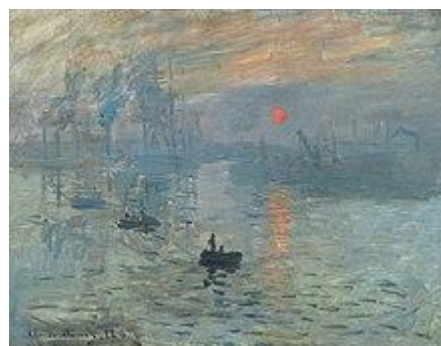
Impression, soleil levant , 1872, oil painting 48 x 63 cm - Marmottan Museum, Paris

He was born in_____,the_____.His father was a wealthy merchant of the time, who dealt in supplies for ships. In 1845 , his family moved to_____, which was an important port on its banks_____.